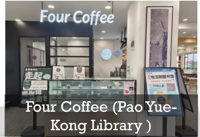
Four Coffee (Pao Yue-Kong Library)