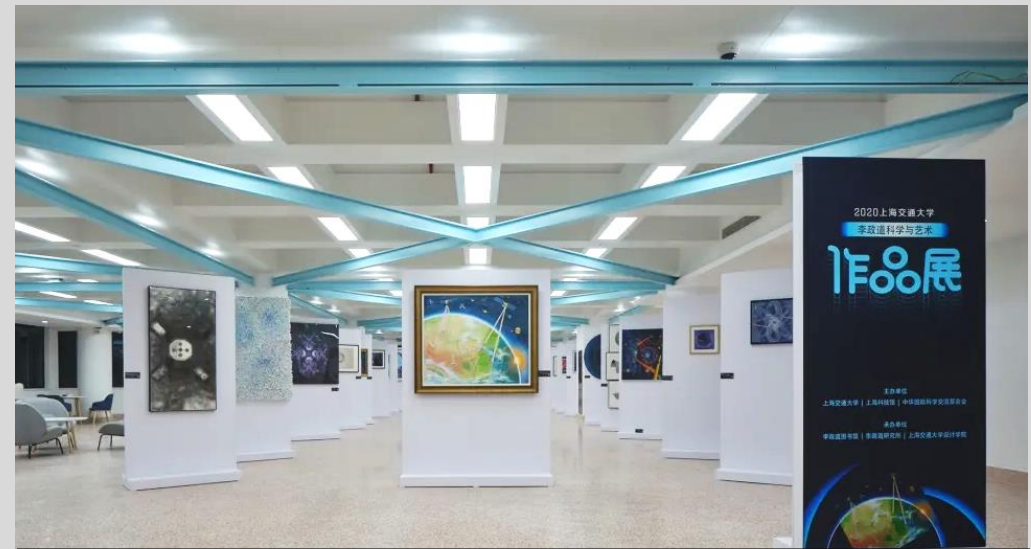
Tsung-Dao Lee Science and Art works exhibition