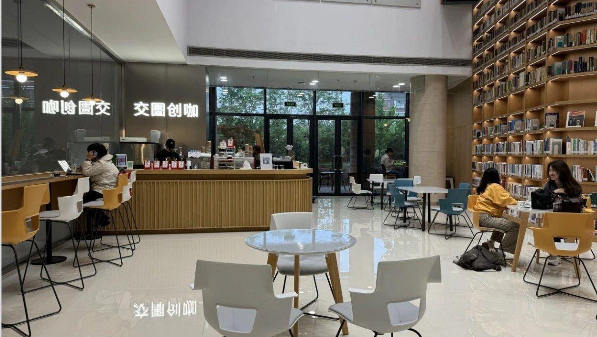
LibCafe (Main Library)