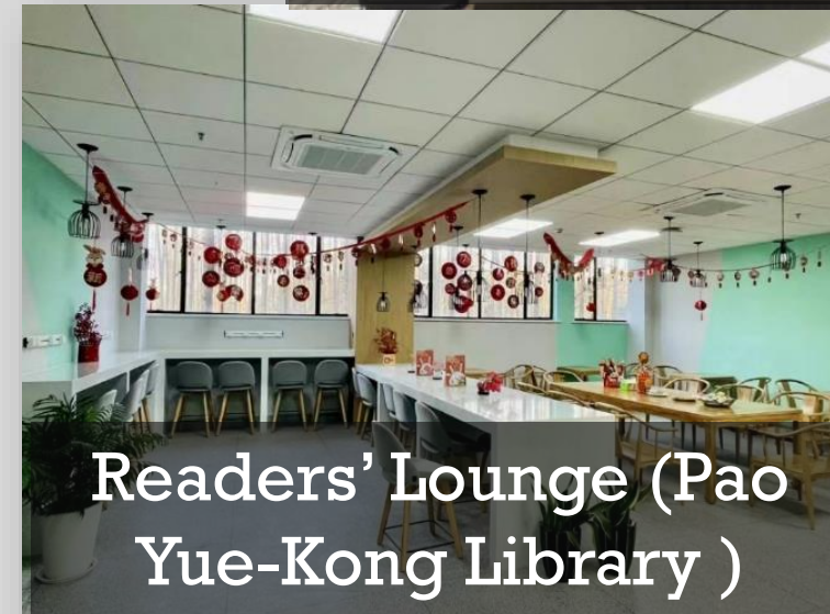
Readers' Lounge (Pao Yue-Kong Library)